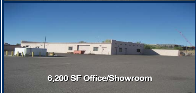
6,200 SF Office/Showroom