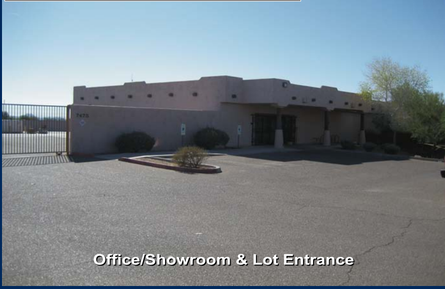
Office/Showroom & Lot Entrance