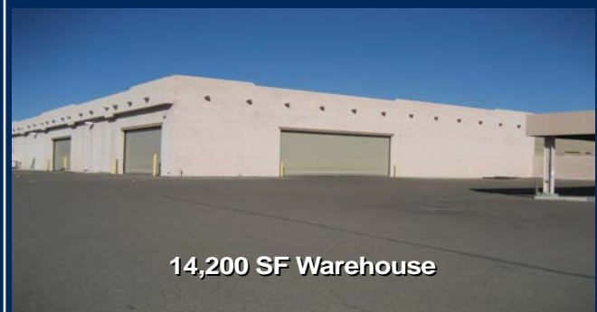
14,200 SF Warehouse