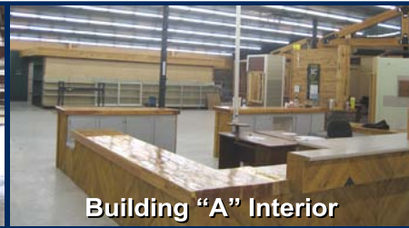
Building "A" Interior