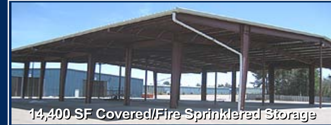
14,400 SF Covered/Fire Sprinklered Storage