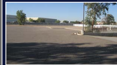
Fenced Storage Yard