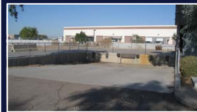
3 Wide Truckwell