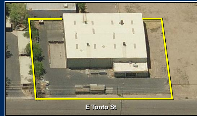
E Tonto St