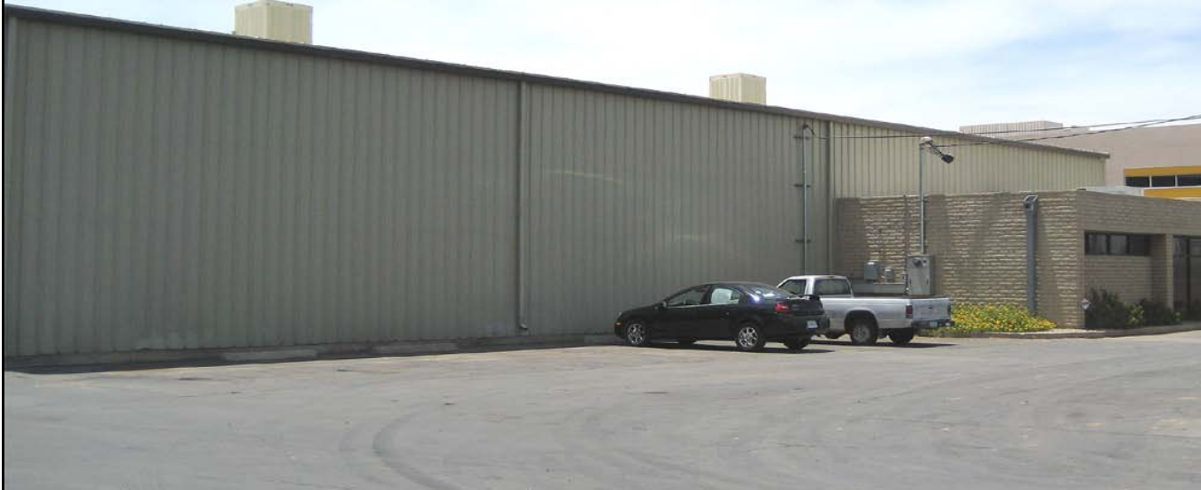
1037 E Tonto St - Phoenix, AZ